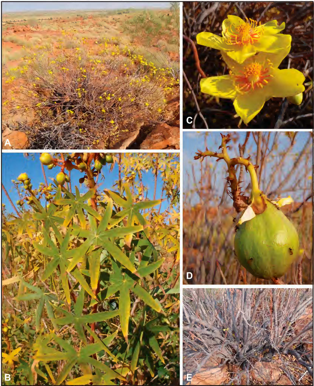
Figure 1. Cochlospermum macnamarae . A – habit and habitat; B – mature leaves; C – flowers; D – fruit; E – base of plants showing numerous stems from rootstock. All photos D. Brassington, from the type locality..